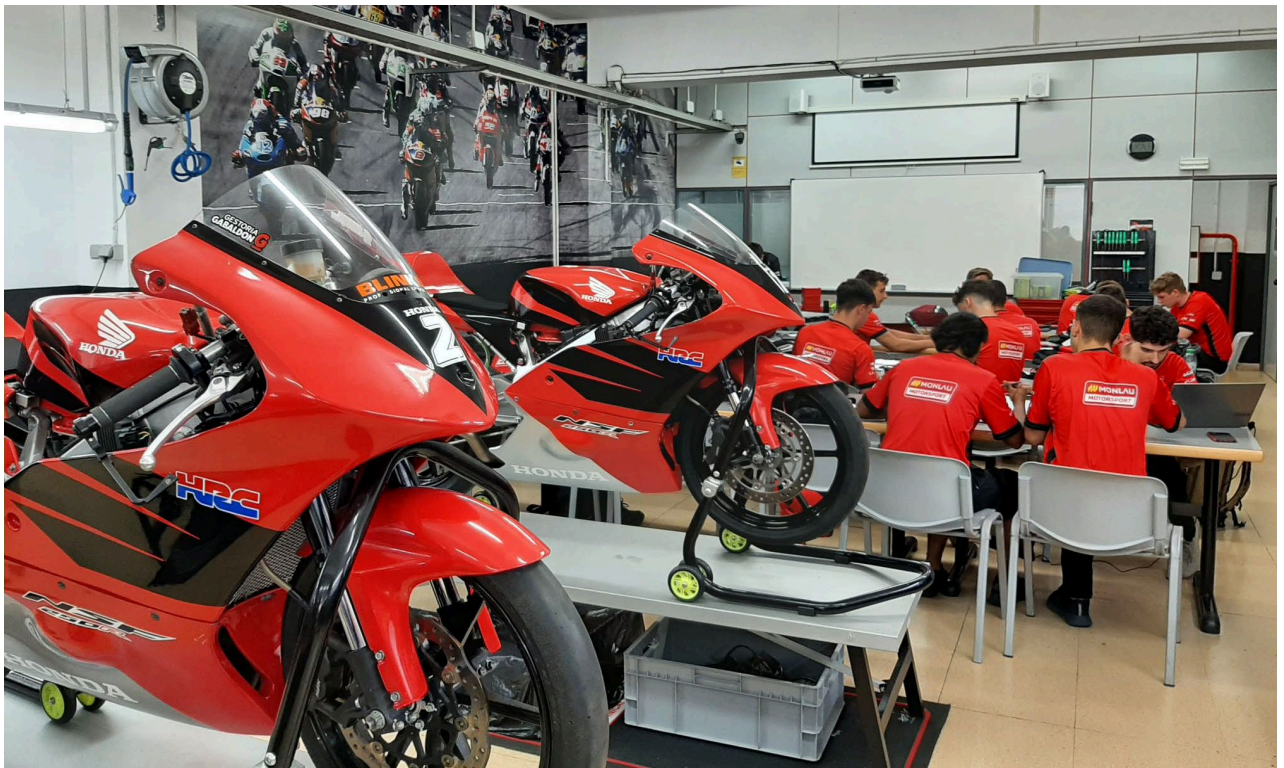
Students in a classroom during a theory lesson.