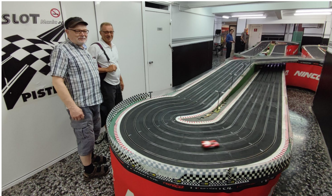
Observing a somewhat different scale of racing facility.