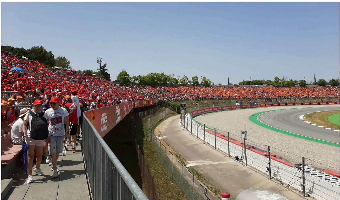
Seats of Xamk's representatives on the very left. People in red on the left are Ferrari supporters. People in orange on the far right are Dutch supporters of Max Verstappen (RedBull).