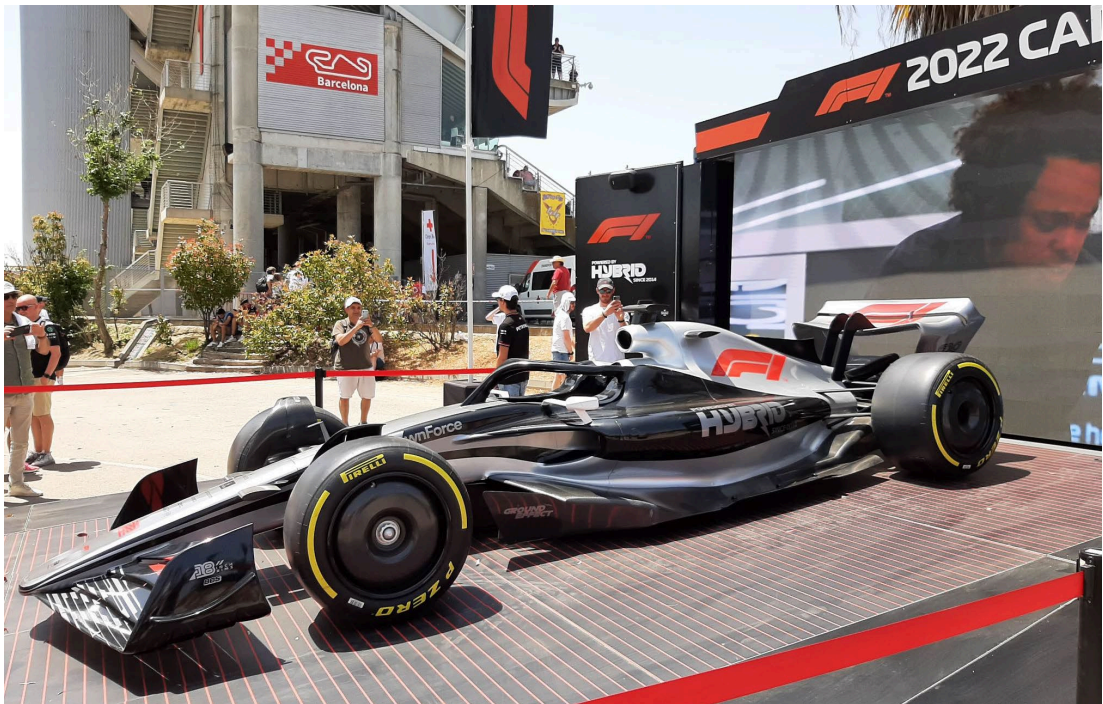
View from outside of the F1 event auditorium.