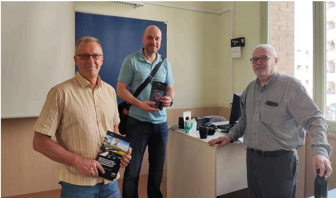
In the classroom after the R4S project presentations.