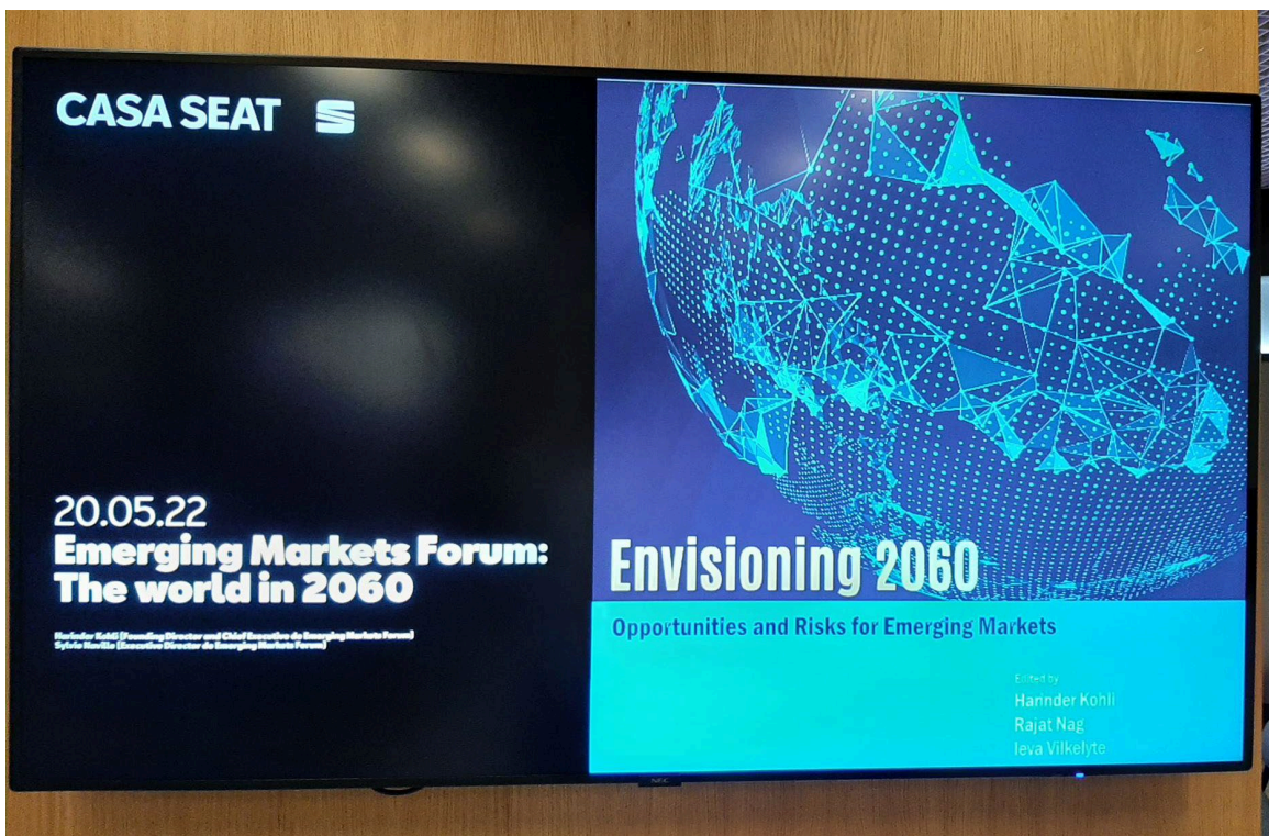
Information about the Forum, where Xamk representatives were invited.

Participation in the Emerging Markets Forum - The world in 2060 seminar invited by Casa Seat (part of VAG Group).