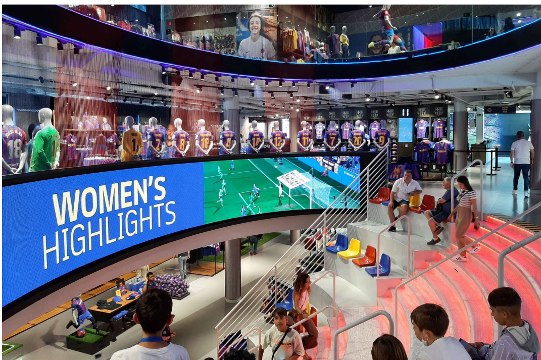
FC Club Barcelona, Camp Nou Stadium. Barça's fan store on three floors.

An excursion to car factory was planned for this day. However, this was cancelled because the SEAT car plant in Barcelona was temporarily closed. These were the same reasons as with the closures of other car factories in globally, due to lockdown and shortage of some major components. This day was the only holiday of the week and was taken advantage of to explore the sights of Barcelona's central area.