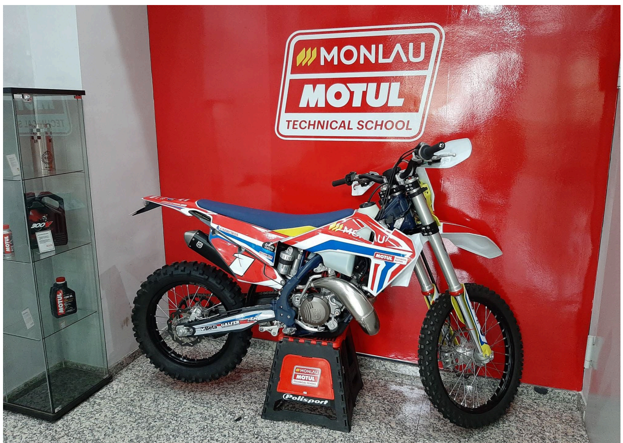
Monlau-Motul Technical School's welcome stand in the entrance hall.

Compared to own experiences about similar educational institutions, it was amazing to see the students' activity in studying, the strength of teamwork and their pride in their own educational institution. Seeing the school's performance, it's easy to believe the director's estimate that they are perhaps the best and best-known school in Europe for training motor sports mechanics.