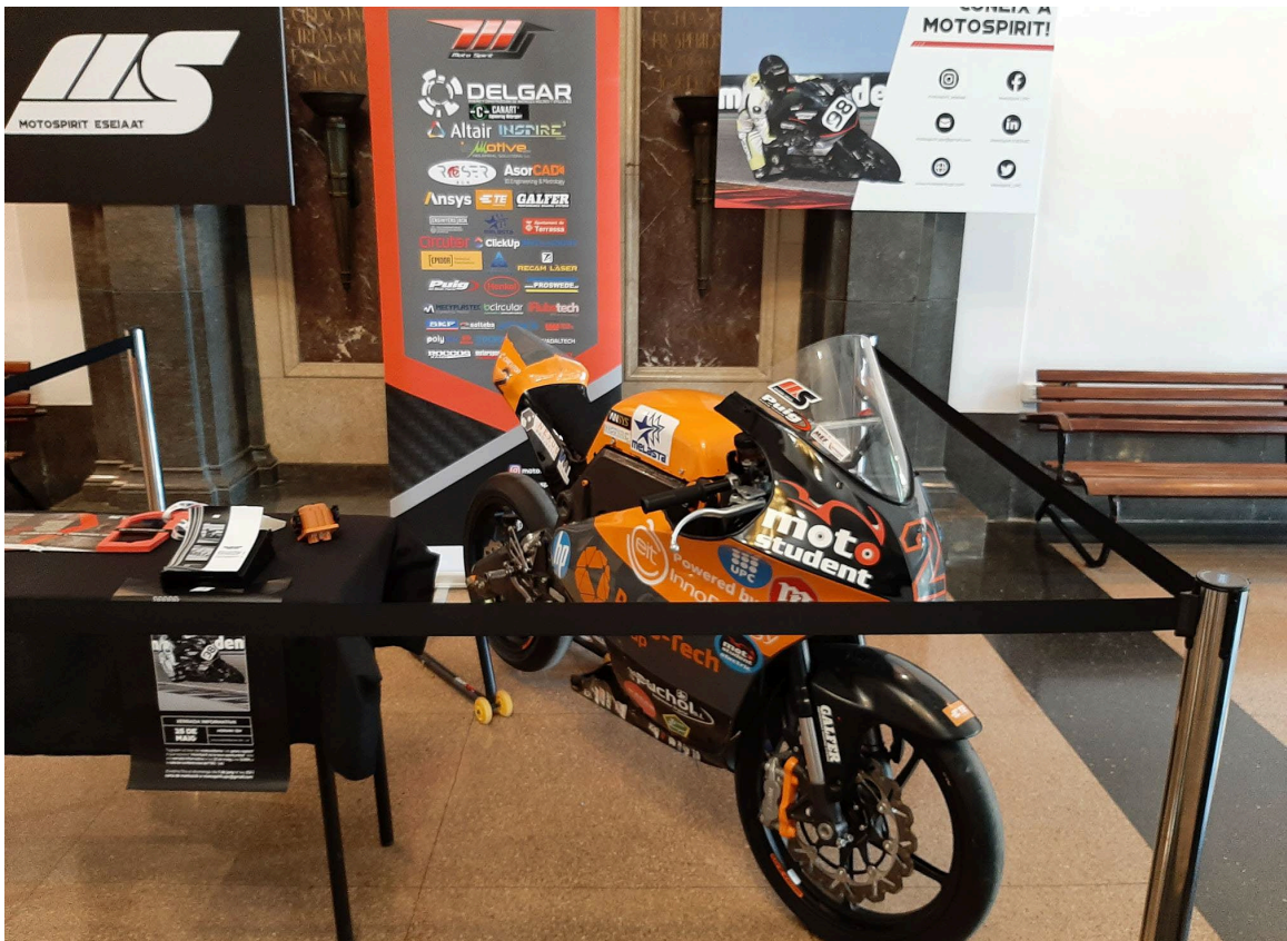
Welcome stand in the main building entrance hall.