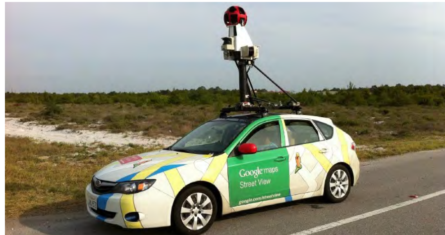
One of the Google Street View cars

For cartography to remain relevant, special cartographic machines (a special car with cameras and lidars) must drive through the streets and “digitize” them. So with the advent of self-driving car racing, a cartography race has begun among companies like Here, TomTom, DeepMap, Ivi5, Carmera, Google and others. In the 21st century, data is the new gold