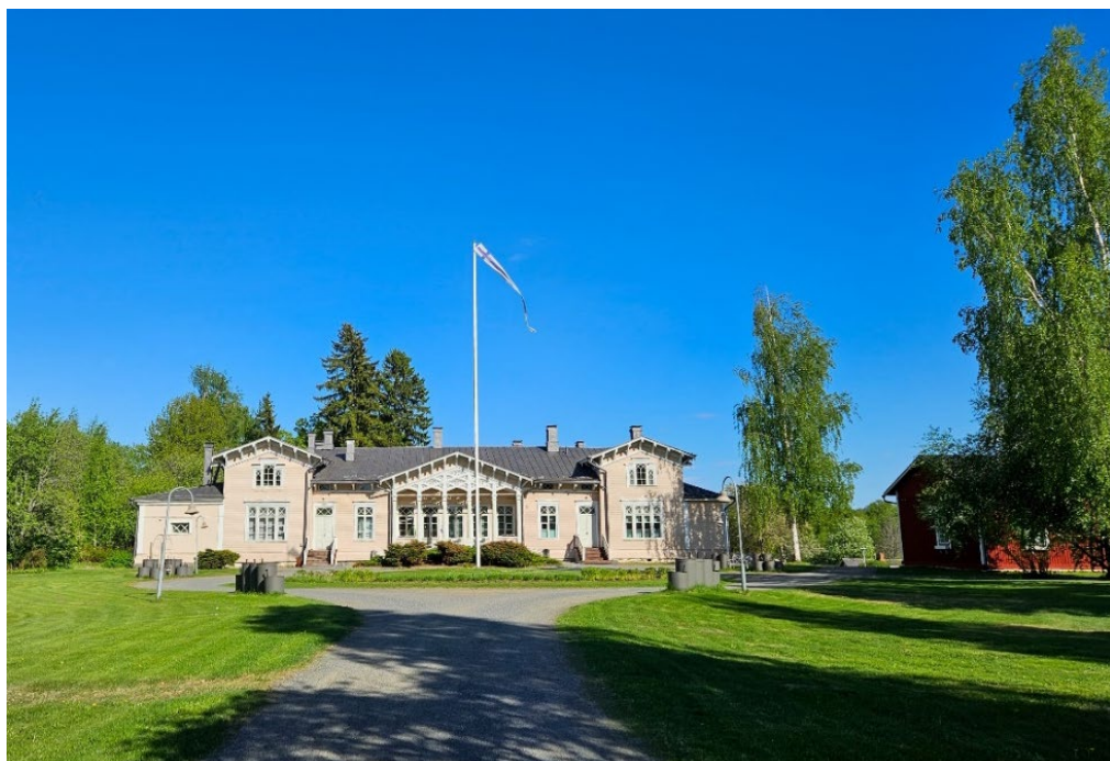
Kenkävero vicarage in summer

Kenkävero is one of the best-known attractions in Mikkeli. It is located approximately 1,5 km from the city centre. In the old, picturesque vicarage milieu they sell handicrafts, organise events, and serve delicacies for smaller and bigger appetite. In the summertime visitors can also enjoy Kenkävero's lovely garden and atmosphere. More information on Kenkävero's website .