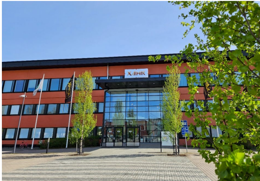
Xamk Mikkeli campus, main building (D) entrance

Xamk Mikkeli campus is located only 1,5 km away from the city centre (approximately 20 min walk). There is also a bus connection (bus 2X ) between the centre and the campus.