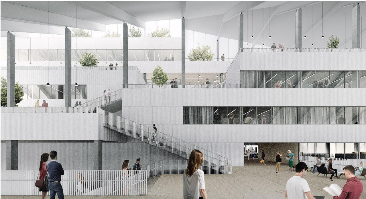
Xamk Kotka campus, lobby

Xamk Kotka campus is located 1km away from the city centre (approximately 10 min walk).