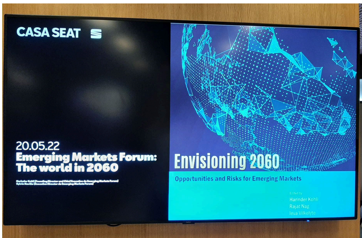
Information about the Forum, where Xamk representatives were invited.

Participation in the Emerging Markets Forum - The world in 2060 seminar invited by Casa Seat (part of VAG Group).